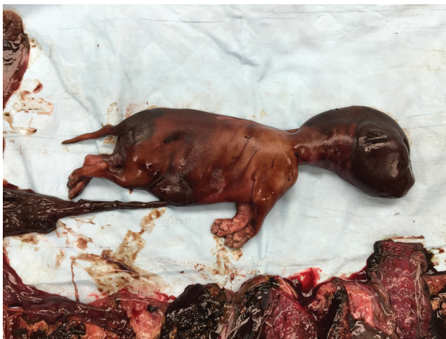
Figure 2. Mummified fetus. Note the elongation of neck and incarceration.

Diaphragmatic hernia in dogs is usually caused by trauma and may be life-threatening if not diagnosed immediately. However, in this case, there are situations in which less severe