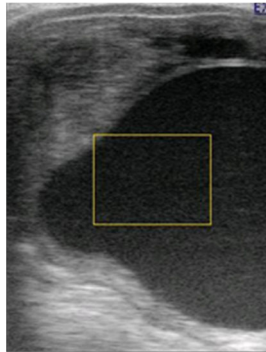
Figure 3. Ultrasonogram of left uterine horn of a mare; note the 55-mm cyst that completely blocked the lumen

Three mares were bred at first estrus following ablation, became pregnant and maintained pregnancy past maternal recognition of pregnancy (MROP). Four mares were bred at concurrent estrus following ablation and were able to maintain pregnancy past MROP. One mare had the largest cyst (Figure 3) that completely blocked the left uterine horn. This mare was in diestrus with no signs of edema, making it difficult to dilate cervix. Cervix was dilated by applying 400 µg of misoprostol (Greenstone LLC, Peapack, NJ). Misoprostol was crushed and mixed in sterile lubricant and applied to cervix. Cervix was digitally dilated over 2 - 3 hours after misoprostol application. Following cyst ablation, transrectal ultrasonographic examination was performed to confirm ablation (Figure 4). Mare was bred artificially at the following season after confirming cyst absence (Figure 5) and became pregnant.