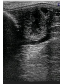
Figure 4. Ultrasonogram of left uterine horn of a mare following cyst ablation