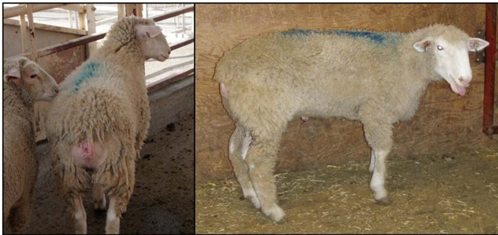
Figure 1. Ante-mortem picture of a female pseudohermaphrodite sheep. Note the significant perineal swelling and lack of a vulva. This sheep has a prepuce and a functional penis.