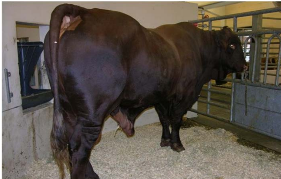
Figure 4. Note position of stoma along the ventral sheath in bull described in case 3.