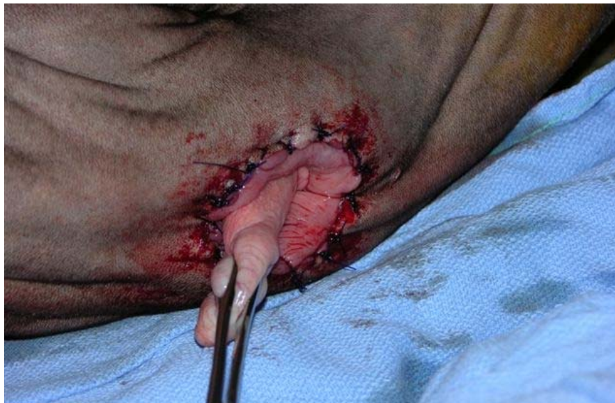
Figure 2. Immediate postoperative image of the preputial stoma created in case 1.