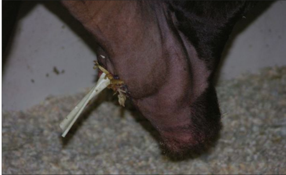
Figure 3. Penrose drain exiting stoma allowing urine drainage away from incision site.