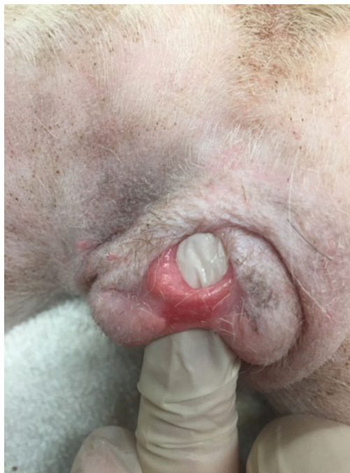
Figure 1. Perineal laceration five weeks after whelping. The dorsal aspect of the vulvar lips have healed together, while the remainder of the laceration is complete.