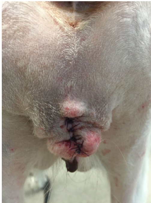
Figure 3. View of the laceration following repair.

(Editor's Note: The photographs in this manuscript are available in color in the online edition of Clinical Theriogenology .)