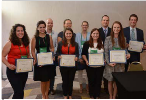
Congratulations to the 2017 ACT Diplomates!